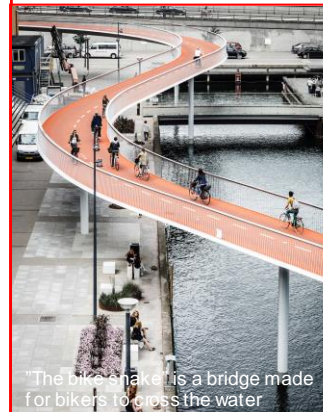
"The bike share" is a bridge made for bikers to cross the water

Have you ever heard about brands such as Georg Jensen, Bang & Olufsen, and Royal Copenhagen? Deep into its soul, Denmark is a design nation. Danish design became a concept known worldwide in the 1950s and 1960s and reflects the essence of Danish culture and style, with focus on user-friendliness and an open and democratic approach to life. Besides contemporary design in furniture and housing, Denmark is moreover renowned for its progress in urban planning, where cyclists and pedestrians are prioritised. Making use of the city by placing focus on urban space for pedestrians and cyclists is a top priority in many of the bigger cities in Denmark. In order to serve the large number of cyclists in Denmark, urban planners are working to develop the cycling infrastructure all over the country.