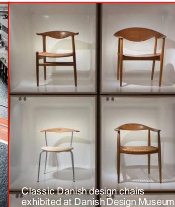
Classic Danish design chairs exhibited at Danish Design Museum