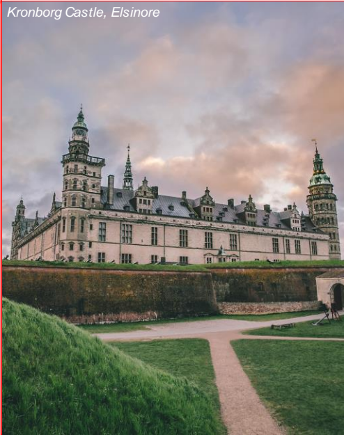
Kronborg Castle, Elsinore