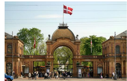
Tivoli, situated in the middle of CPH. Photo: