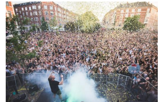
Distortion, street party 2018.

There are many options throughout the year for music lovers that are visiting Copenhagen. Especially during the summer months, Copenhagen is buzzing with events and concerts to enjoy. More and more music festivals (and festivals in general) have been popping up lately. A very popular festival is Distortion in early June, which is a festival in the streets of Copenhagen with DJs and concerts. Later on another popular festival is Stella Polaris , a festival in a beautiful garden in the area Frederiksberg where you can go and chill out while listening to electronic music with friends and family. The historical amusement park Tivoli throws a weekly concert on all Fridays from April to September. The concerts are free – you just need to pay entrance to Tivoli, and you're in. Besides the music festivals there are food, science, light and nature festivals – you pick!